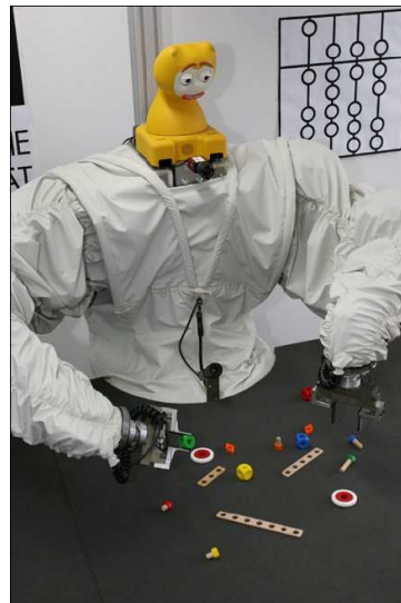
Figure 1: The JAST human-robot interaction system

Vision processing in the JAST system (Figure 1) is performed on the output of a single camera, which is installed directly above the table looking downward to take images of the scene. The camera provides an image stream of 7 frames per second at a resolution of 1024 \times 768 pixels. The output of the vision process (recognized objects, gestures, and parts of the robot) has to be sent to a multimodal fusion compo-